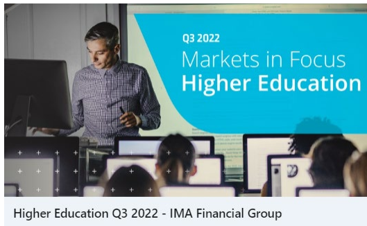
Higher Education Q3 2022 - IMA Financial Group

As you prepare your 2023-24 fiscal year budgets, learn how the insurance market is reacting to current private college dynamics within Cyber Risk, Excess / Umbrella limits, Property Valuations, etc. and strategies to review for 2023 and beyond.