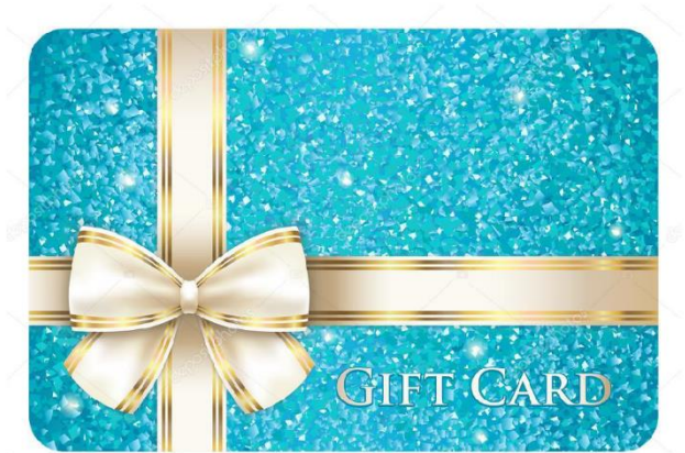
Click on Gift Card or scan QR code for additional information